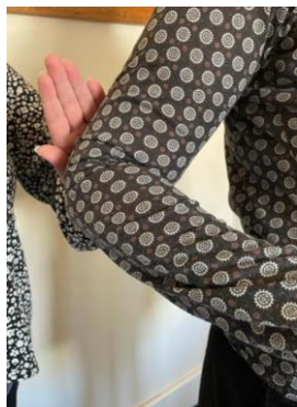
Reference: Prompting 1