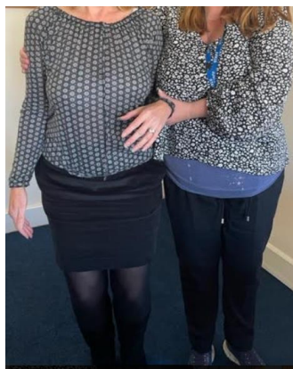
Reference: Escort 4