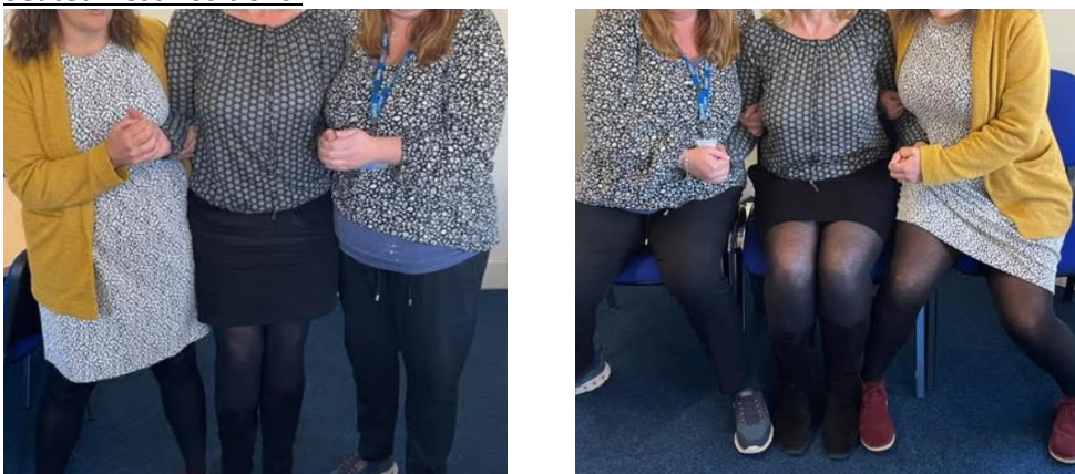
Reference: Seated rest position 7