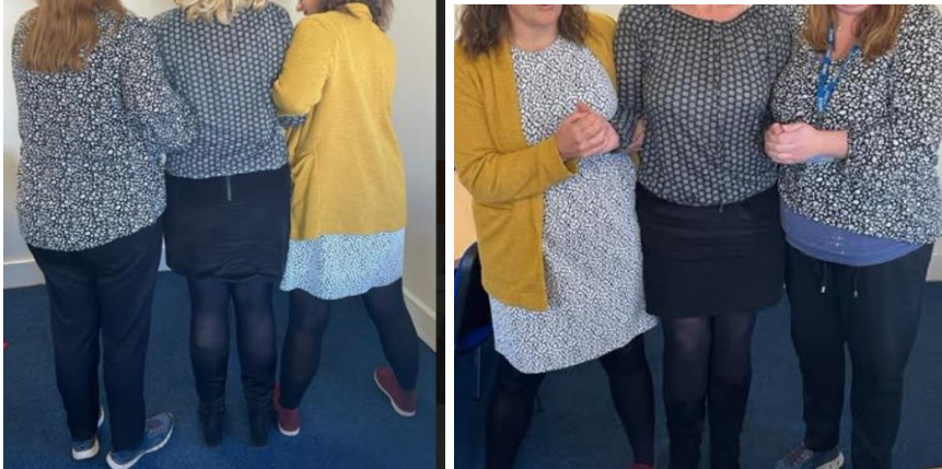
Reference: Double cup hold 5