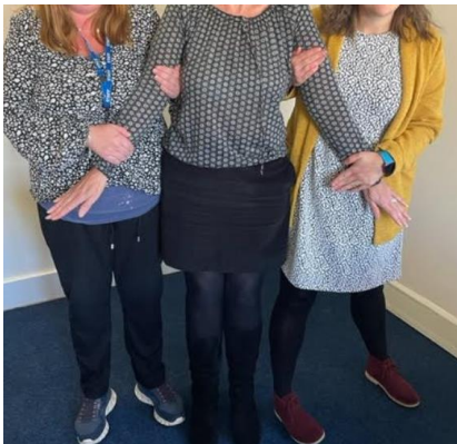
Reference: Straight arm immobilisation 6