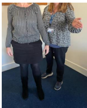
Reference: Prompting 2