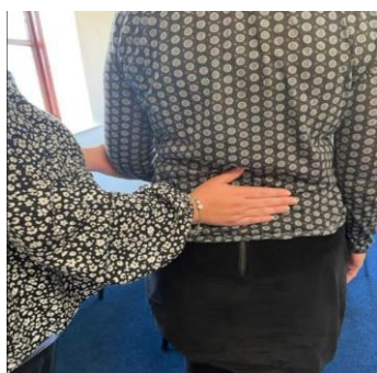
Reference: Guiding 3